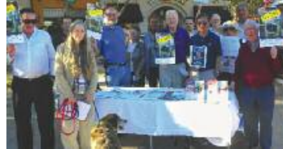
Rally in California for the 2010 World Day.

Although executions continue to be carried out in many regions worldwide,