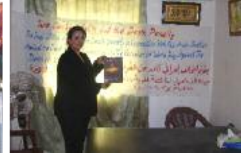
"We can live without the death penalty". Meeting in Baghdad, Iraq, World Day 2010.

there is an overall trend towards abolition. Every year there are fewer executions taking place and less people sentenced to death. In 2010, twenty-three countries were known to have carried out executions in comparison to the mid-1990s during which forty countries on average carried out death sentences according to Amnesty International figures. 139 countries have now abolished the death penalty in law and in practice as pressure from the international community rises and more governments turn away from this cruel and inhuman practice.