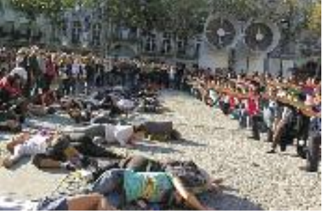
Flash Mob in Paris, October 10, 2010.