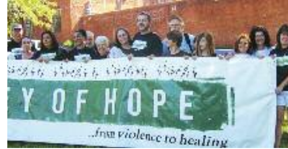
Rally in Texas, USA, for the World Day 2010.