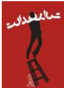
"JUSTICE/EDALAT", Poster 4 Tomorrow, Aida Torkamani Asl, Iran